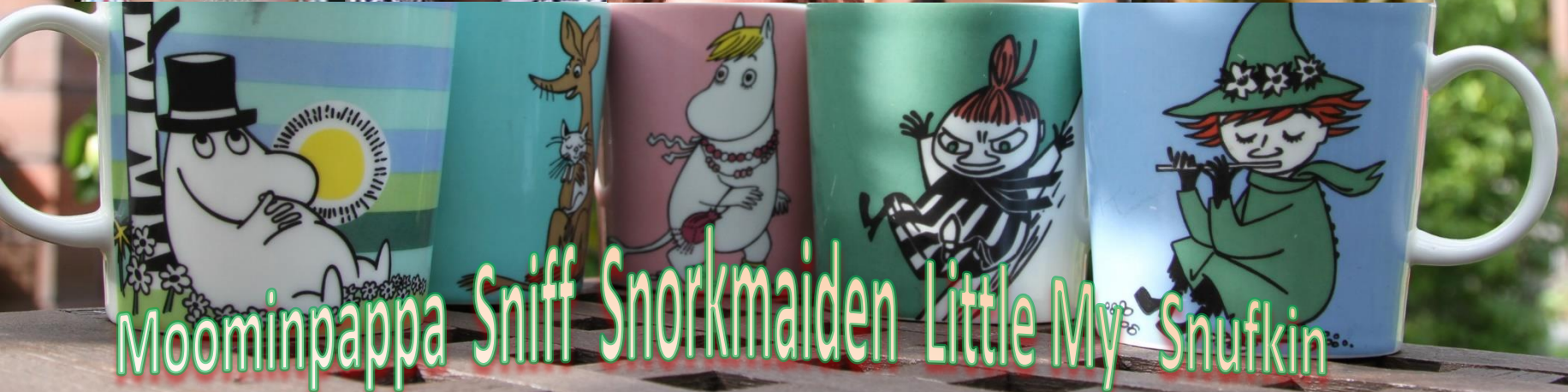
Moominpappa Sniff Snorkmaiden Little My Snufkin